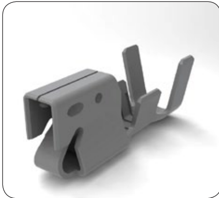
EP II Phos Bronze Pre-Tin Contact 18-22 AWG, part number 1744144-1